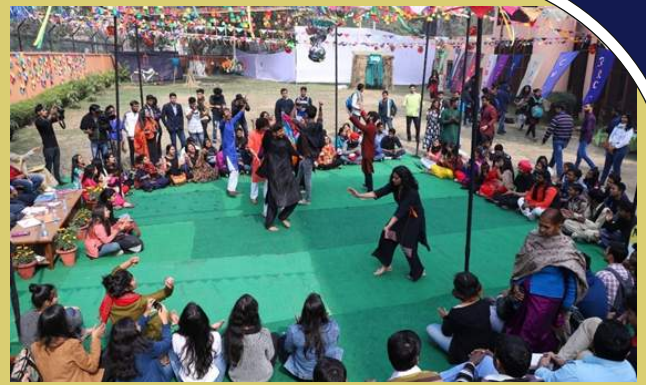
Creative Pursuits, Entranced Audiences