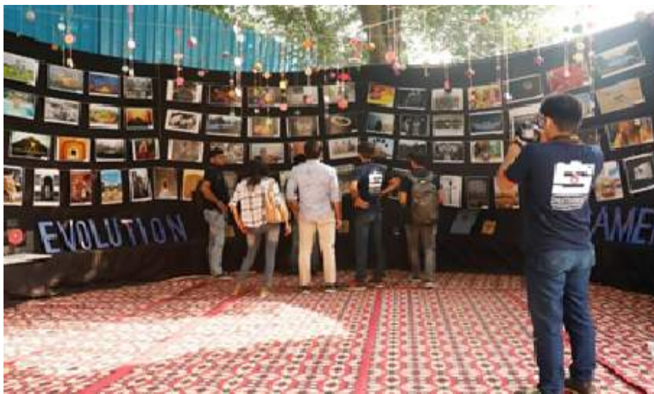
Cinedrome - Photography Exhibition

'Cinedrome' is an annual film and photo fare by SHUTTERBUGS. The seventh edition of 'Cinedrome,' the annual festival of the society, was held on October 29, 2018, and witnessed some incredible pictures and world-class