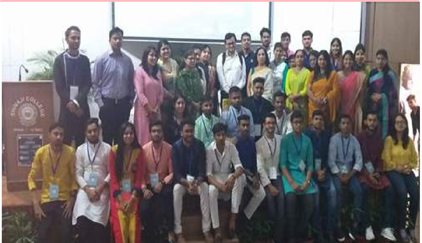
Annual Shivaji Bhonsle Debate 2018 - Dictum

The Hindi parliamentary debate was a three-day-long event wherein thirty-eight teams from various institutions competed for the running trophy. Hindu College and the contingent of IGNOU reached the grand finale. After a great debate, Hindu College grabbed the awaited trophy.