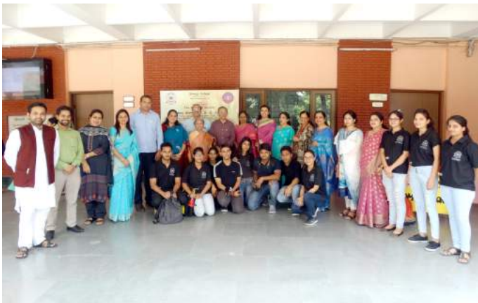
Student Volunteers and Teachers at the Inaugural Lecture of the Botanical Society