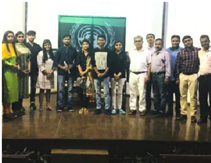
UN Day Department of Political Science

November 13 is another historically important day. The Department of Political Science commemorated