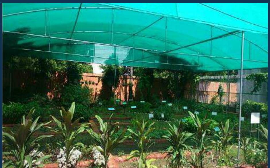
Plant a Free Gift a Life