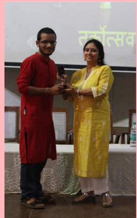
Hindi Parliamentary Debate Prize winner

Annual Shivaji Bhonsle Hindi Parliamentary Debate 2018 from September 15-17, 2018.