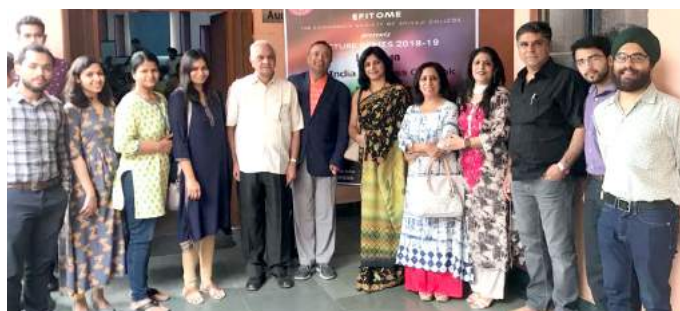
Lecture Series: Department of Economics