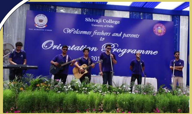
Entering College Life