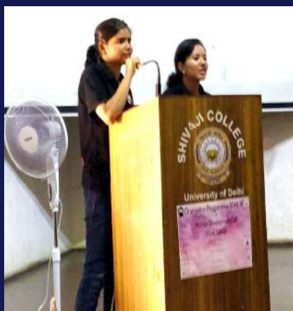
Discussions on Women Empowerment

A discussion on Pink Tax, Gender Empowerment, Feminism and LGBTQ Rights was part of the programme. WDC faculty, student members, and the MOU partners of WDC were introduced at the event.