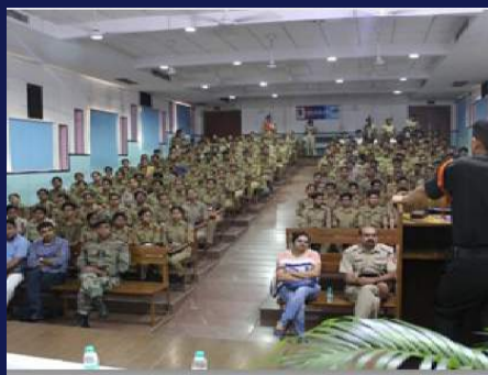
Surgical Strike Day in the College Auditorium