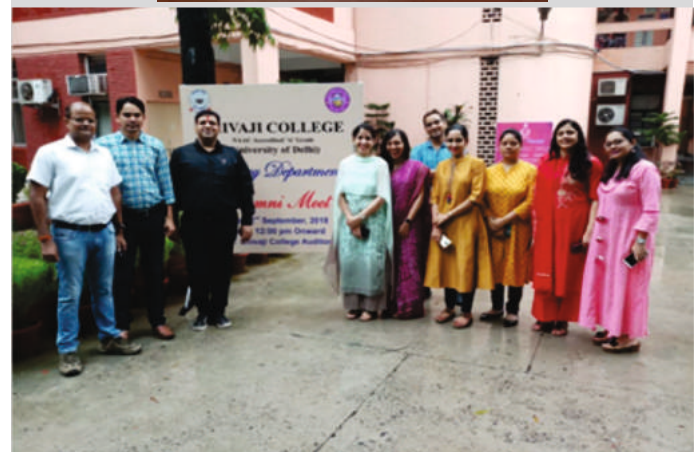
Down Memory Lane - Alumni Meet, Department of Zoology