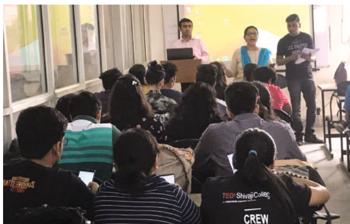
A Learning Experience