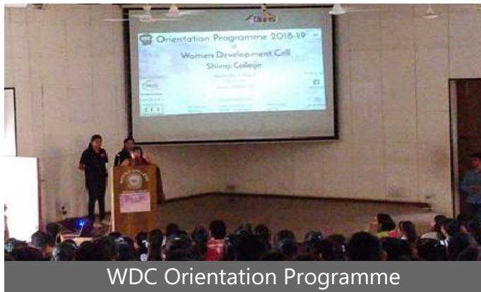
WDC Orientation Programme

The Women Development Cell at Shivaji College undertakes activities and projects that continue to build women's capacity and agency, and thus empowering them. Throughout the year, the WDC organises community outreach programmes that are designed to bring about a gender-friendly and gender-equal community.