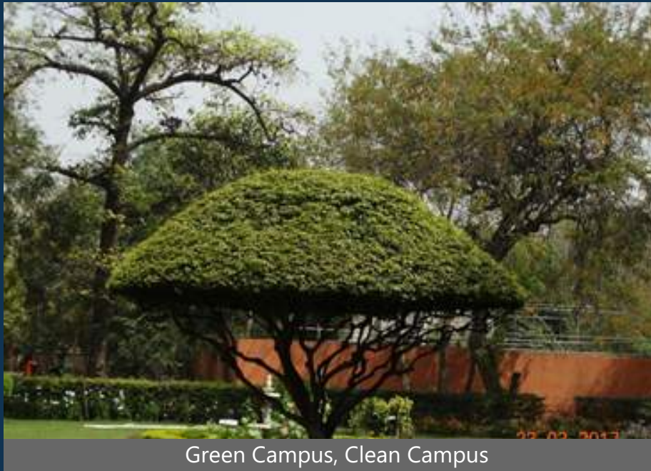
Green Campus, Clean Campus

responsibility among students. The college recognises the imperative need for conservation and cleanliness, and maintains vehicle-free and smoke-free premises. Adoption of best practices and eco-friendly measures like rainwater harvesting pits, solar power panels, vermicomposting pit, and herbal garden aid in reducing carbon footprint and in keeping the college clean and green. Adding to these measures, airy corridors, well-ventilated classrooms, and LED lights on the campus contribute towards building a healthy campus.