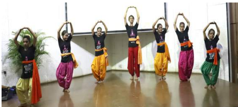
Dance Towards Freedom