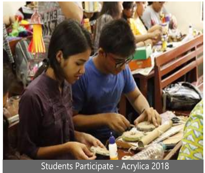
Students Participate - Acrylica 2018