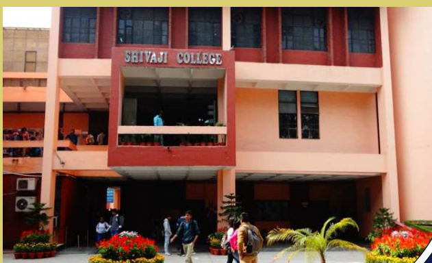
Premises of Learning