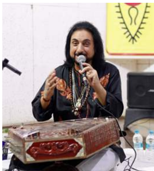
Pandit Bhajan Sopori's Performance

In an effort to promote Indian art forms amongst the youth, Shivaji College (University of Delhi) organized Virasat 2018, a cultural event in collaboration with SPIC MACAY, on October 8, 2018 in the college auditorium. The event was graced by renowned Bharatanatyam dancer and vocalist (Padmashri) Geeta Chandran and the Santoor legend and music composer (Padmashri) Pandit Bhajan Sopori.