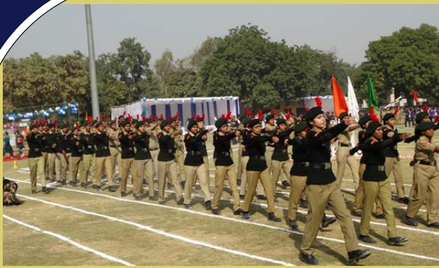
Forward, We March!