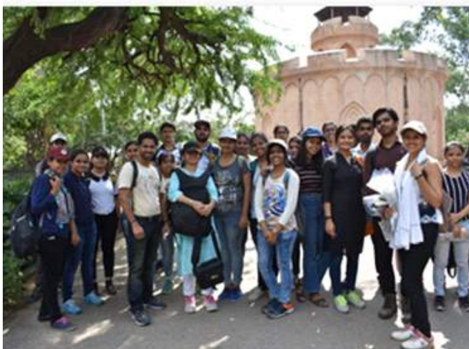
In the Midst of Nature