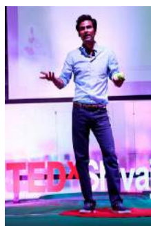
Mr. Muhammad Kaif Sharing his Experiences