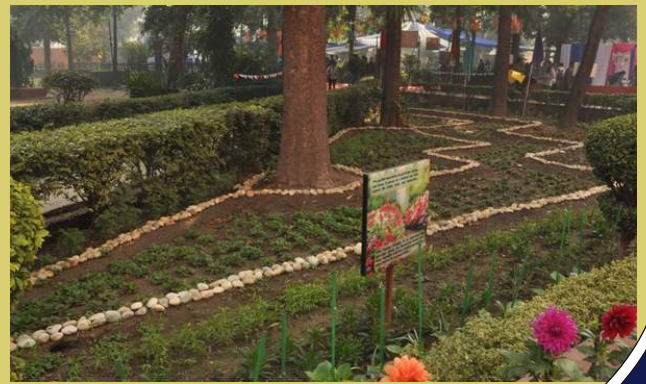
Into the Soothing Greens