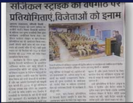
Media Report on Surgical Strike Day