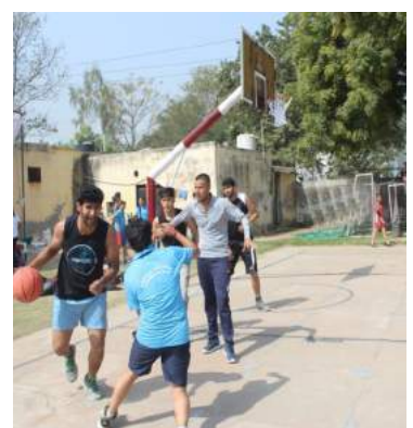
Fun in the Sun