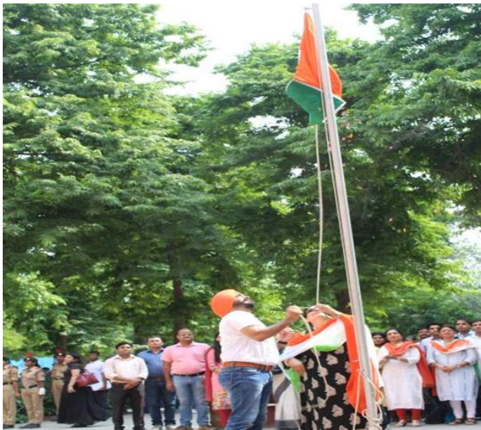
'Where the mind is without fear and the head is held high' Rebindranath Tagore

J ana-seva is Janardhana-seva – Service to people is service to God. Indeed, community service is a noble pursuit and cannot be accomplished without an element of self-sacrifice. Obligation and duty towards society are values enshrined in its extra-curriculum design at Shivaji College, and students and teachers join hands to implement these values into action.