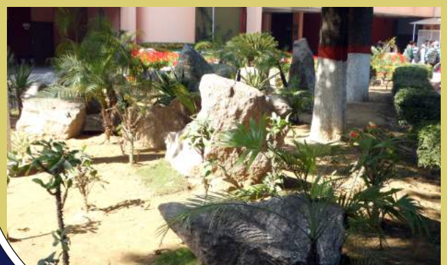
Knowledge amongst the Greens