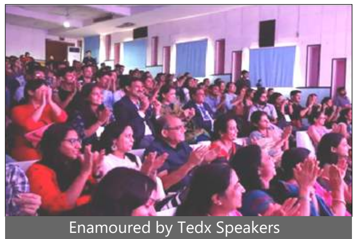
Enamoured by Tedx Speakers

Shivaji College organised its first ever TEDx event on August 24, 2018, bringing together individuals from every discipline and culture who believe in the power of ideas to change attitudes, lives and ultimately, the world. The event was themed 'F5: Refresh', which stands for refreshing our mundane life with the input of new ideas, outlook, and perspectives.