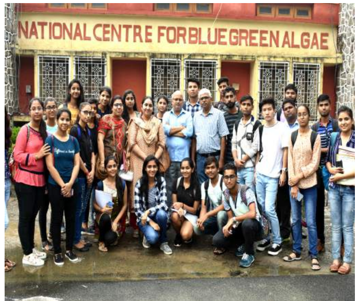
Educational Trip Department of Botany