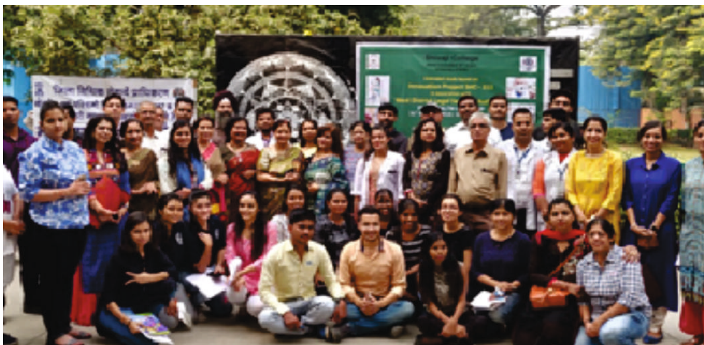
Health Mela 2018

capacity and percentage oxygen saturation of blood, physiotherapy, and recording of electrocardiograms. Medical professionals of alternative fields of medicine like homeopathy, ayurveda and acupuncture were also a part of this event.