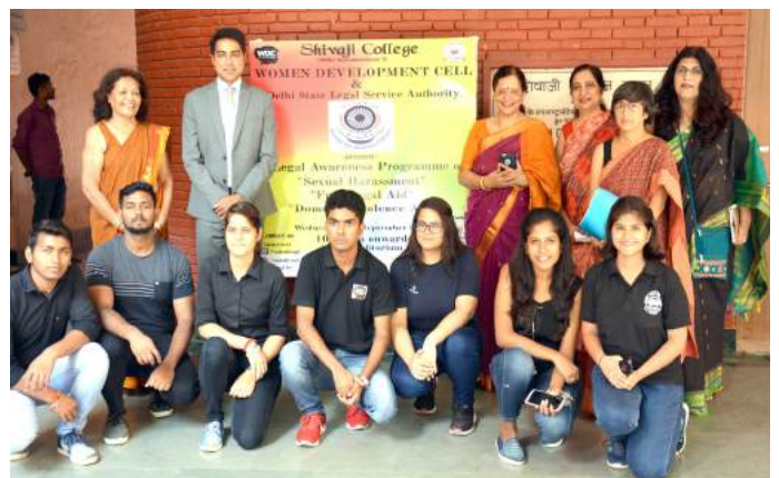
Legal Awareness Programme - WDC

Two gender sensitisation programmes were organised by the WDC in collaboration with different partners. On August 31, 2018, the WDC and Srijanatmak Manushi Sanstha (SMS) collaborated to sensitise young students to forms of gender disparity in the society. Theatre, music and dance were the means of sensitisation and the highlight was the street