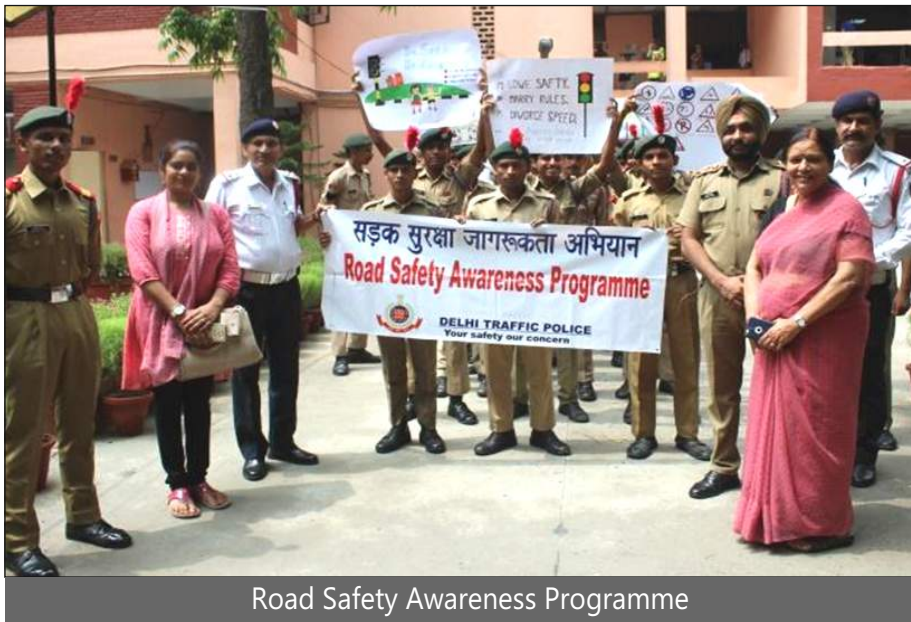
Road Safety Awareness Programme