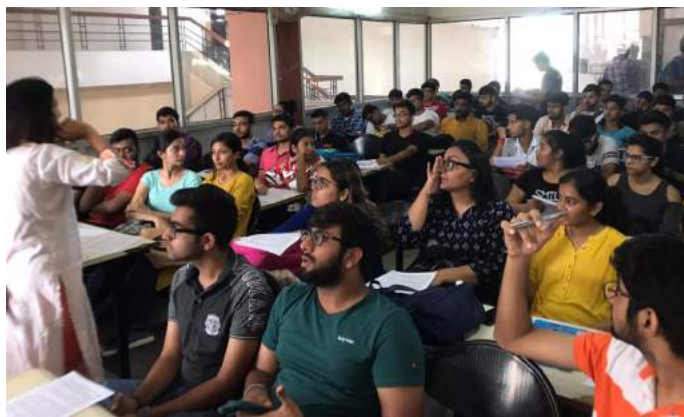
Seminar - Department of Business Economics